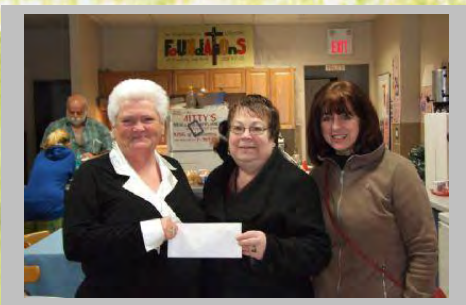
Thanks to YOUR generosity!